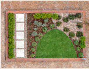
1. Cottage Garden

Matilda is generous as well as beautiful, offering all homeowners the opportunity to claim free front landscaping! There are six professionally designed options to choose from. The photos don't do these gorgeous gardens justice, so visit the display at the Matilda Sales Office and enjoy their beauty!