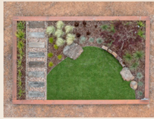
2. Matilda Grassland