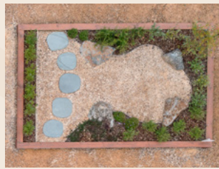
4. Australian Native Garden