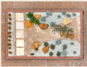
3. Coastal Garden