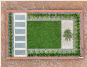
5. European Garden