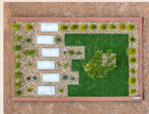
6. Contemporary Garden